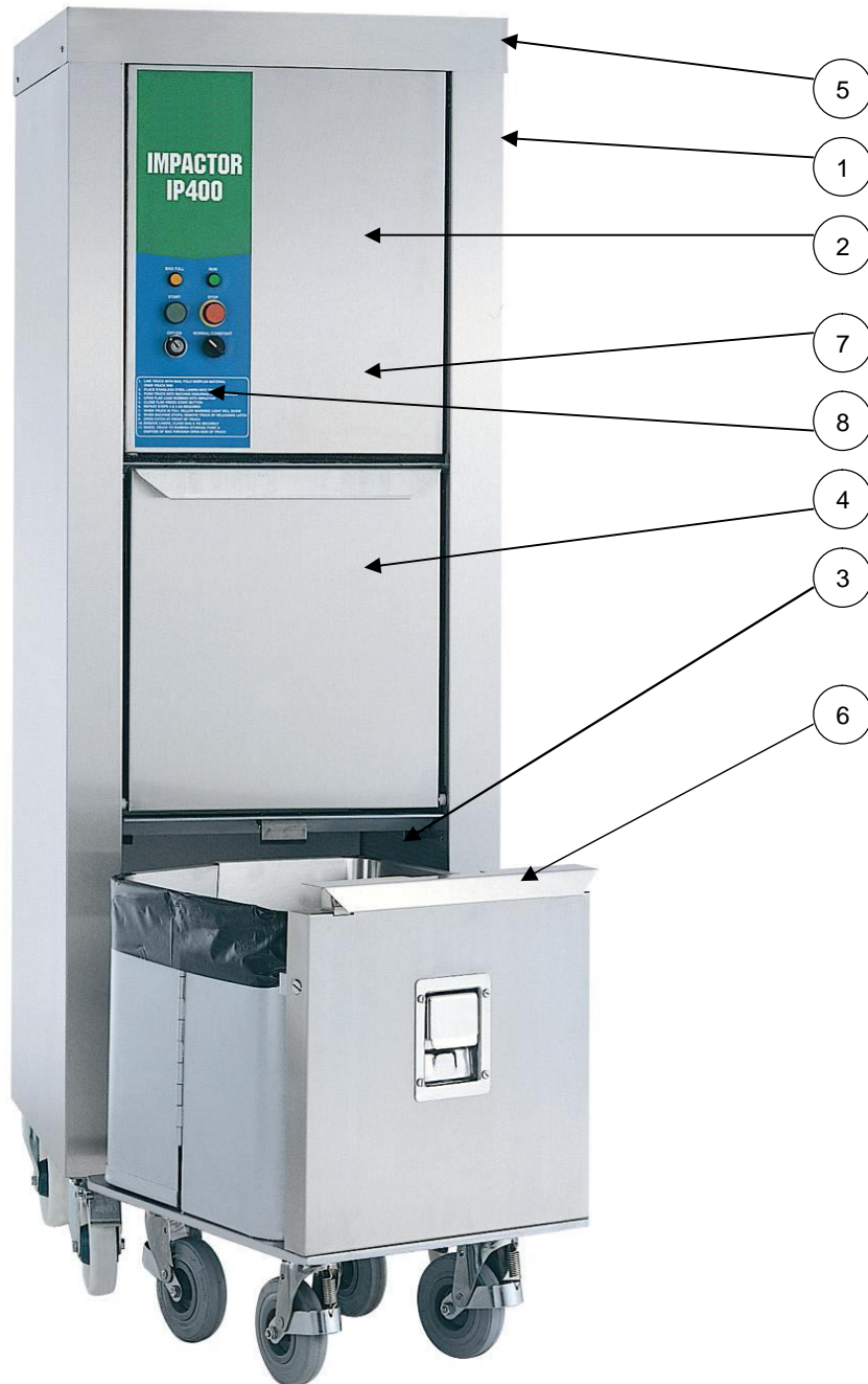
Parts Illustration – IP400 Fig.2