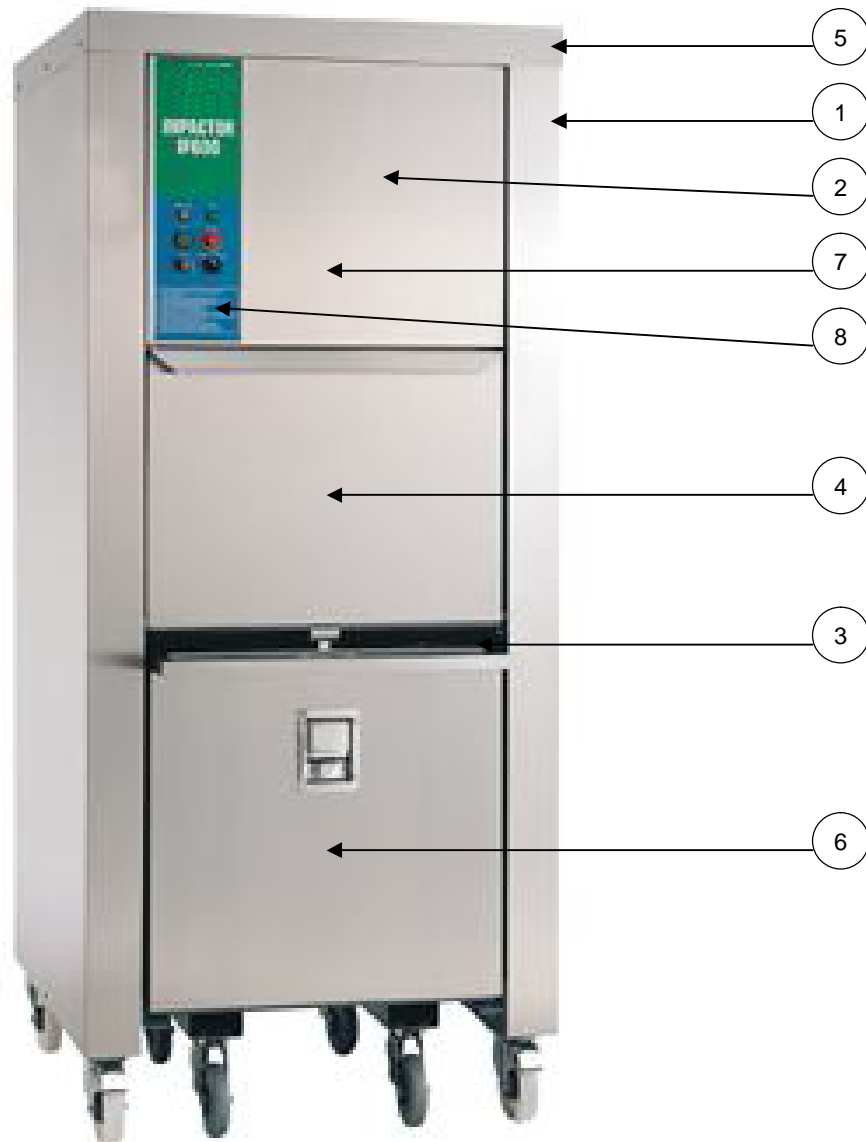
Parts Illustration – IP600 Fig. 4