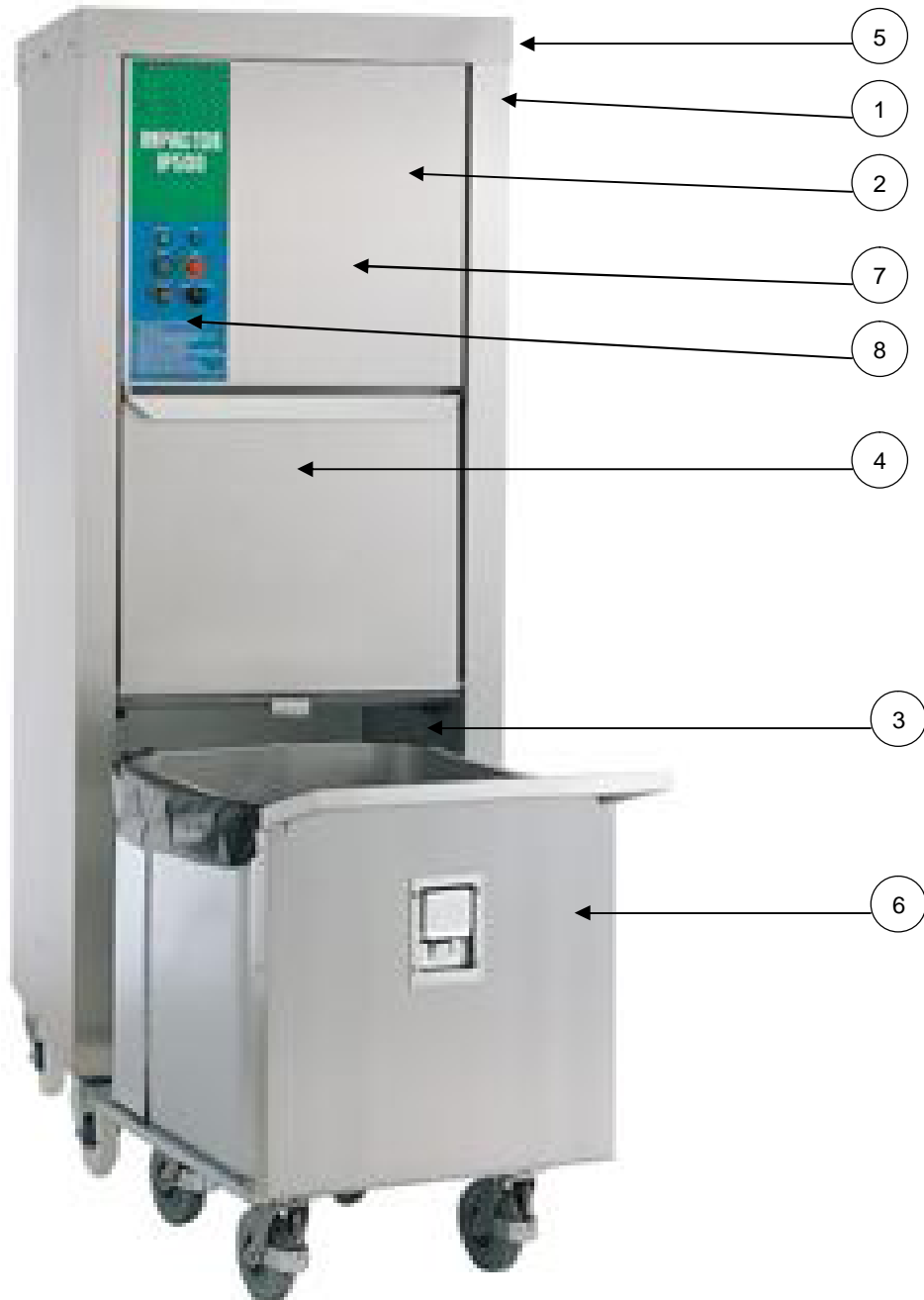
Parts Illustration – IP500 Fig.3